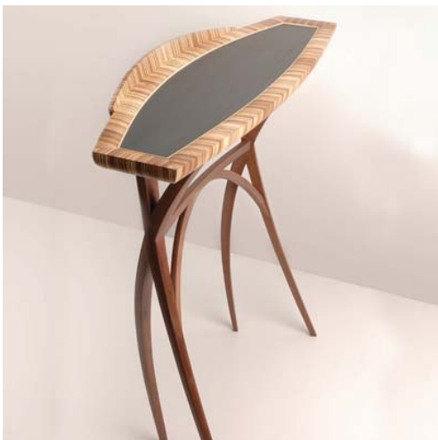
Zebrawood, Walnut, Slate Entry Table by Reed Hansuld

Last but by no means least; by purchasing ecologically friendly furniture for your home, you will be doing your bit to help prevent deforestation. Purchasing eco-friendly goods will help to prevent global warming and deforestation to some extent and will help to reduce the amount of waste which can be accumulated from manufacturing furniture in a non-ecologically friendly manner.